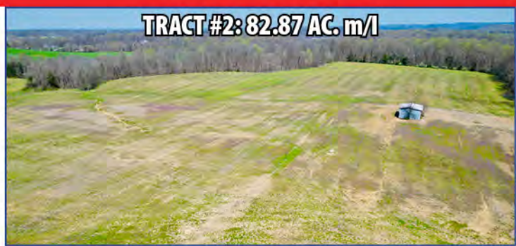
TRACT #2: 82.87 AC. m/l

Viewing: View Land Anytime and House by Appointment or OPEN HOUSE Saturday, April 18 th 4-6pm CDT