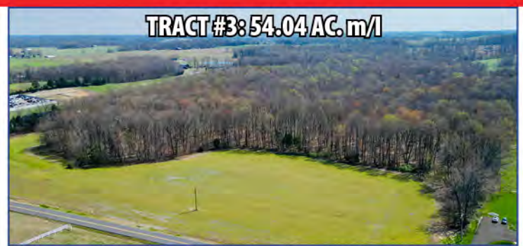
TRACT #3: 54.04 AC. m/l

Tract #2: Offers 82.87 acres, m/l, mostly cropland, adjoining the Corp of Engineers w/ older barn & mature timber remaining w/ property. Blacktop frontage, county water & electric available, plus springs & streams. Lots of deer & turkey! Approx 46 acres, m/l, of cleared ground have been used for deer crops with balance in nice woodlands. Property is unrestricted.