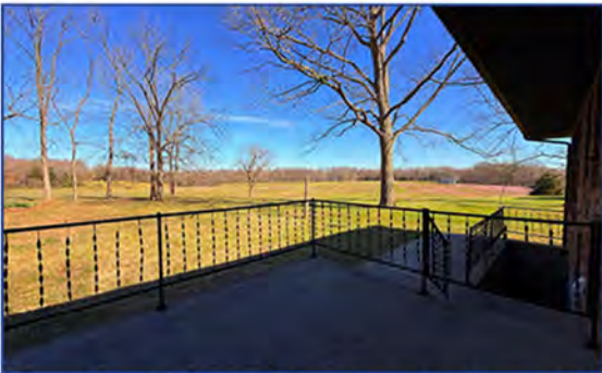
TRACT #1: BRICK HOUSE & METAL BARN ON 2.88 AC. m/l

Tract #1: Offers a 1-owner, 2 to 3 bedroom / 2.5 bath brick house w/ finished basement & attached garage on 2.88 acres, m/l, w/ 32ft x 48ft metal barn. Property offers a beautiful, park-like setting with countryside views outback! This brick house offers 1,945 sq ft +/- of living space on main level, plus an additional 1,354 sq ft +/- in the basement having fireplace, utility room, storage, ½ bath & outside entrance. Main level offers a large living room, kitchen that opens to the great room w/ vaulted ceiling and brick fireplace, formal dining area & office / study. Also, additional all-purpose room off the garage. House has large front and rear patio porches, 2 central heat & air units, huge 2-car garage, blacktop circle drive & storage shed. Come enjoy this beautiful country home.